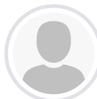
Sandoz Speaker Sandoz